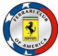
CENTRAL STATES REGION